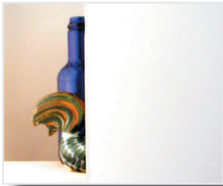
GL 700 Flashed White Opal on Clear

Flashed white opal glass is typically used for lighting, drafting tables, x-ray boxes, etc.