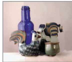
PIL 540/6 Pilkington Flemish A soft undulating pattern, causing some distortion of view, with minimal obscurity.