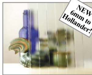
VGL 070/6 Masterglass Master-Ligne A clear ribbed pattern of simple 2-1/2mm lines, approximately 2 cm apart, on an extremely fine, even textured, translucent matt background.