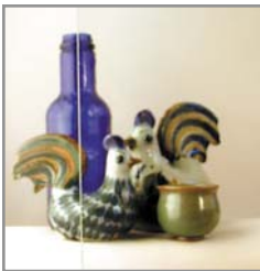
GNA 0189/6 German Artista, Clear A soft flowing and striating pattern, with minimal obscurity.

* Approximate size as sizes may vary from shipment to shipment.