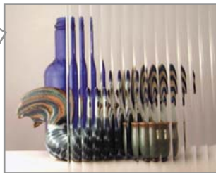
PIL 535/6 Pilkington Reeded 1/2" An even ribbed pattern - reeds are 1/2" wide, and comes in 2 sheet sizes.