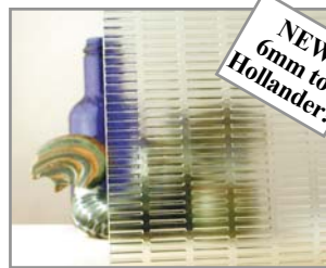
VGL 077/6 Masterglass Master-Ray A geometric pattern of 2mm x 24mm clear lines, on an extremely fine, even textured, translucent matt background - most obscure of the 6mm Masterglass patterns.