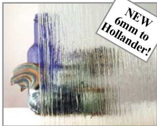
PIL 520/6 Pilkington Cotswold A sophisticated uneven striated pattern resembling rain.