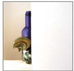
GL 730 Glaverbel Flashed White Opal A solid, glossy, white opal glass with maximum obscurity.