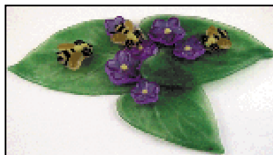
Shows finished product for blossoms, honey bees, and tropical leaves.

Use this mold and create a single lily pad and three frogs. Turn the mold over and use the slumper built into the mold's reverse side to shape the lily pad casting into a small bowl. Attach the frogs to the bowl as feet to make a beautiful, finished piece. On the other hand, these same pieces can be collaged into plates, bowls, and platters. Fill weight: 124 grams (lily pad) and 23 grams (frogs). Dimensions are 5" (lily pad) and 1-1/2" (frog).